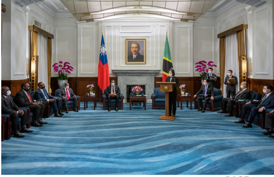
TRADE AT A GLANCE