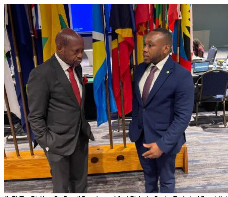
for OECS Mission in Geneva

The meeting was held under the theme 'Consolidating the OECS Economic Union Through Sustainable Trade Capacity Building.' This is the fourth meeting of the Council of Ministers of Trade.