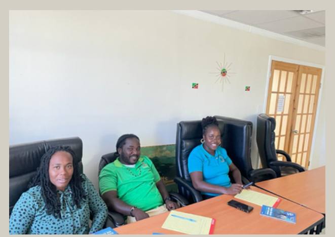
General Cross-Training Session