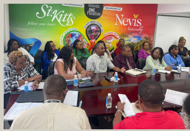
I.M.C.C with Port, Maritime and Tourism et al

This committee also examines the various policies and programs across Ministries and Departments and identifies areas of convergence, to determine where the crosscutting areas can be streamlined to avoid duplication of efforts. This approach helps to curtail already limited resources.