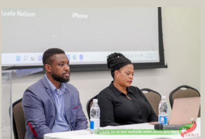
The Facilitators for The Symposium

Covid-19 has dictated that the way we do business must change. This was one of the observations that prompted the Department of Industry and Commerce to initiate a symposium on Supply Chain Management during the first week in March. Participants in this symposium lauded the event and considered it very timely. Some of the topics covered included, procurement, planning techniques, transportation among others. The department will continue its efforts to support the business community as we seek to promote enterprising culture and foster job creation.