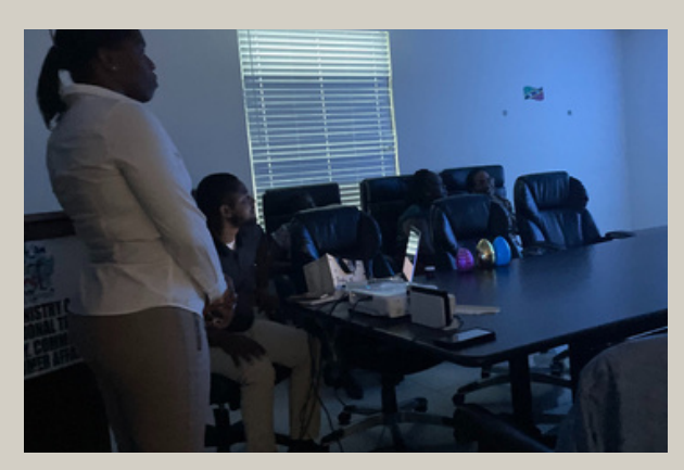
Presentation of The Manufacturing Strategy

Over the past weeks we engaged in rigorous and strategic sessions with each department within the Ministry of Trade with the aim of identifying the skills and tasks needed in the workplace to fill the gaps. These exercises were very successful and should continue during the next quarter. Cross-training helps you build insurance against the inevitable. At some point, you'll have to cover for an absent employee.