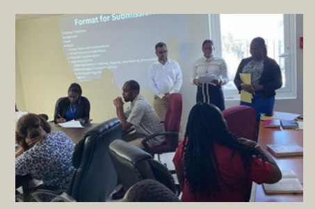
Cabinet Submission Sessions